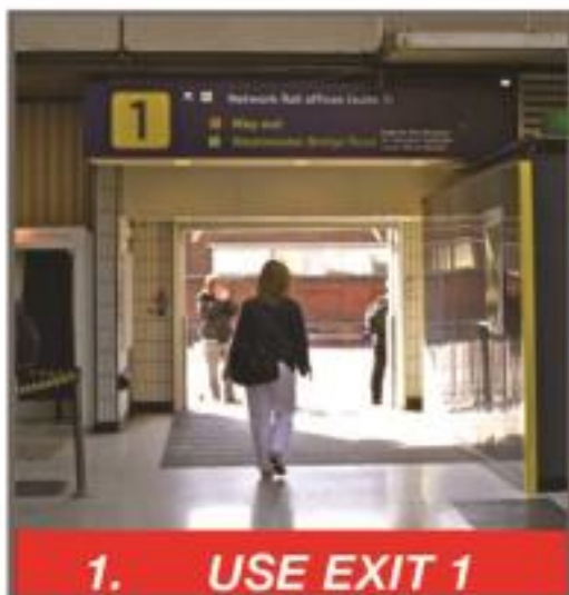
1. USE EXIT 1