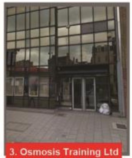
3. Osmosis Training Ltd